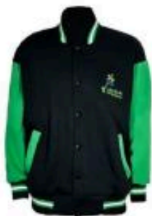
Black/Green Bomber Jacket With Emb