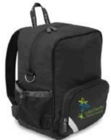
Black Bag With Logo