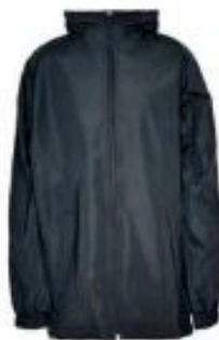
Black Waterproof Rain Jacket