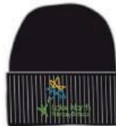
Black Beanie With Emb