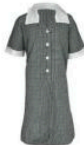
Bottle/White Gingham Summer Dress