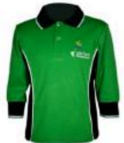
LS Green/Black Polo With Emb