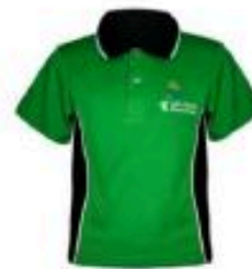
SS Green/Black Polo With Emb