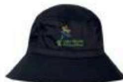
Black Bucket Hat With Logo