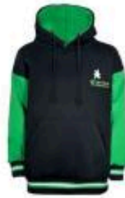
Black/Green Hoodie With Emb